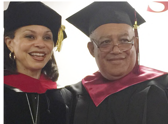
Special Contribution Plans (Monthly Giving Available)